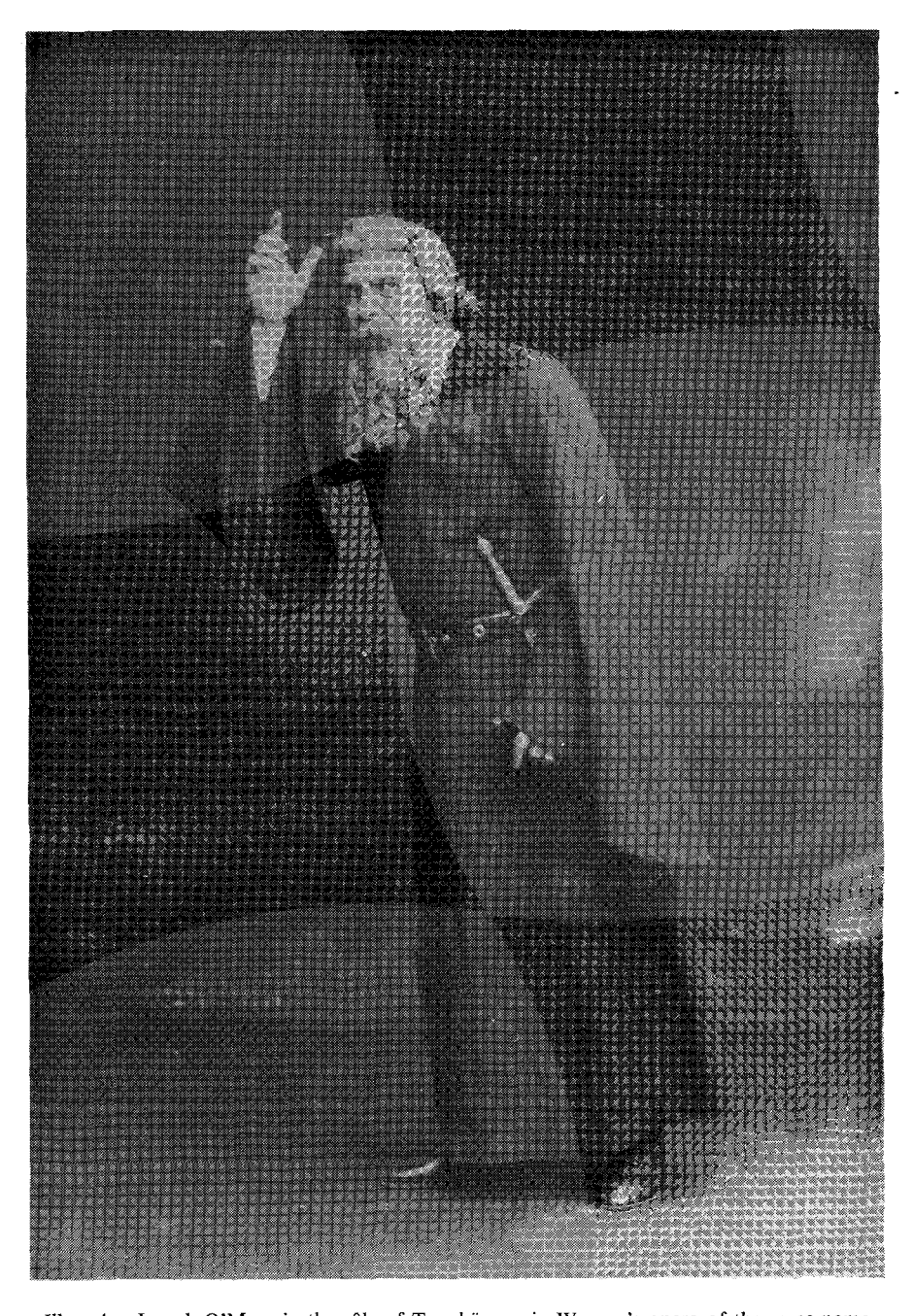
Illus. 4. Joseph O'Mara in the rôle of Tannhäuser, in Wagner's opera of the same name.