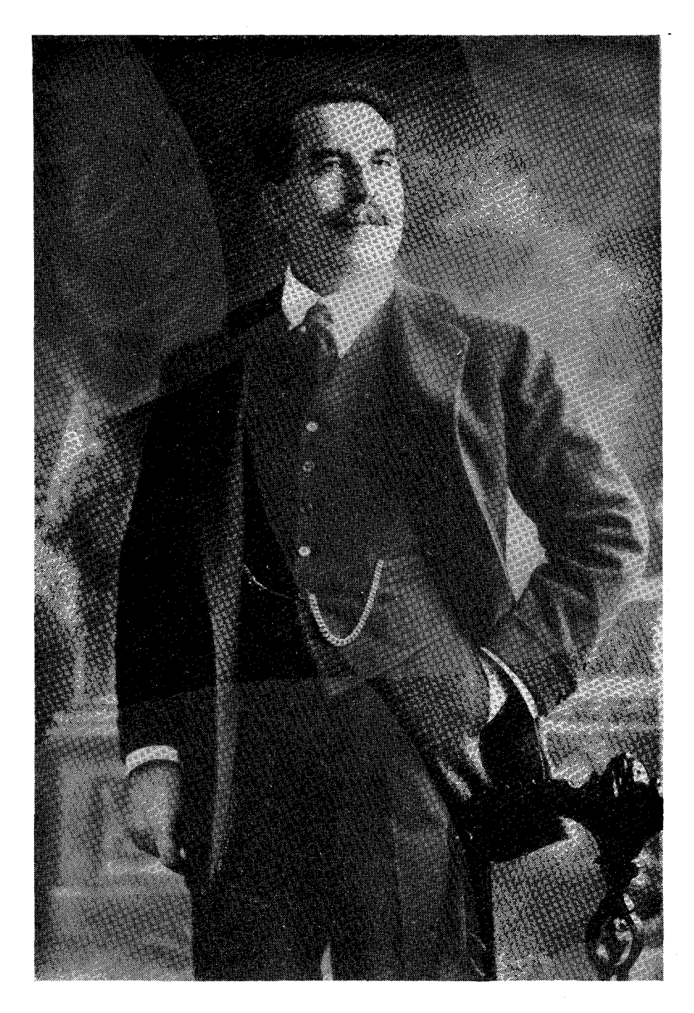
Illus. 3. Joseph O'Mara, Limerick's world-famous operatic tenor.